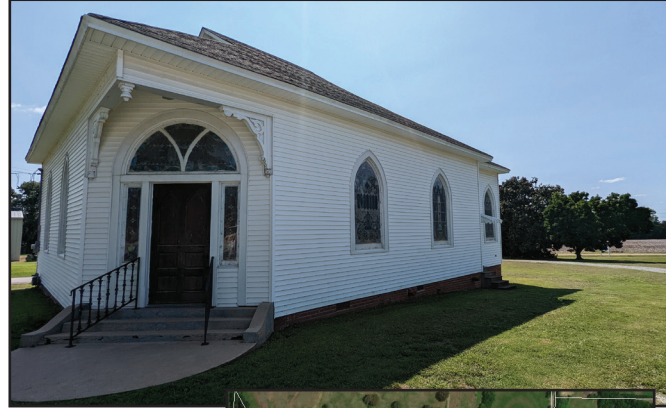
Woodlawn Baptist Church in Nutbush (above) and the Haywood County Farm were both nominated for the National Register of Historic Places in FY2023. SWTDD provides help to historic zoning commissions, surveys historic resources, and contributes to Tennessee's Plan for Historic Preservation.

SWTDD is one of the Tennessee Department of Transportation's 12 rural planning organizations for enhanced service and rural transportation development. Our RPO serves all SWTDD counties with the exception of Madison County. The Southwest Tennessee RPO leadership consists of an executive committee and technical committee; these groups meet at least two times each year.